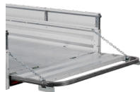
Extend - Extensible