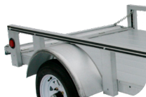
Extends / Extensible